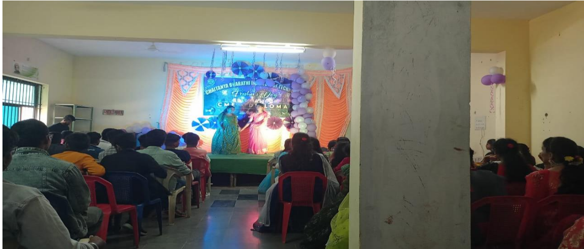
DANCE PERFORMANCE BY THE STUDENTS (DCME)

(Approved by AICTE New Delhi, Permanently Affiliated to JNTUA, Anantapuram) Accredited by NAAC & Recognized by UGC under the section 2(f) and 12 (b) of UGC Act, 1956 VIDYA NAGAR, PALLAVOLU (V), PRODDATUR-516360, Y.S.R (Dt), A.P