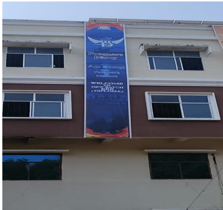
BANNERS FOR THE EVENT (DEEE)