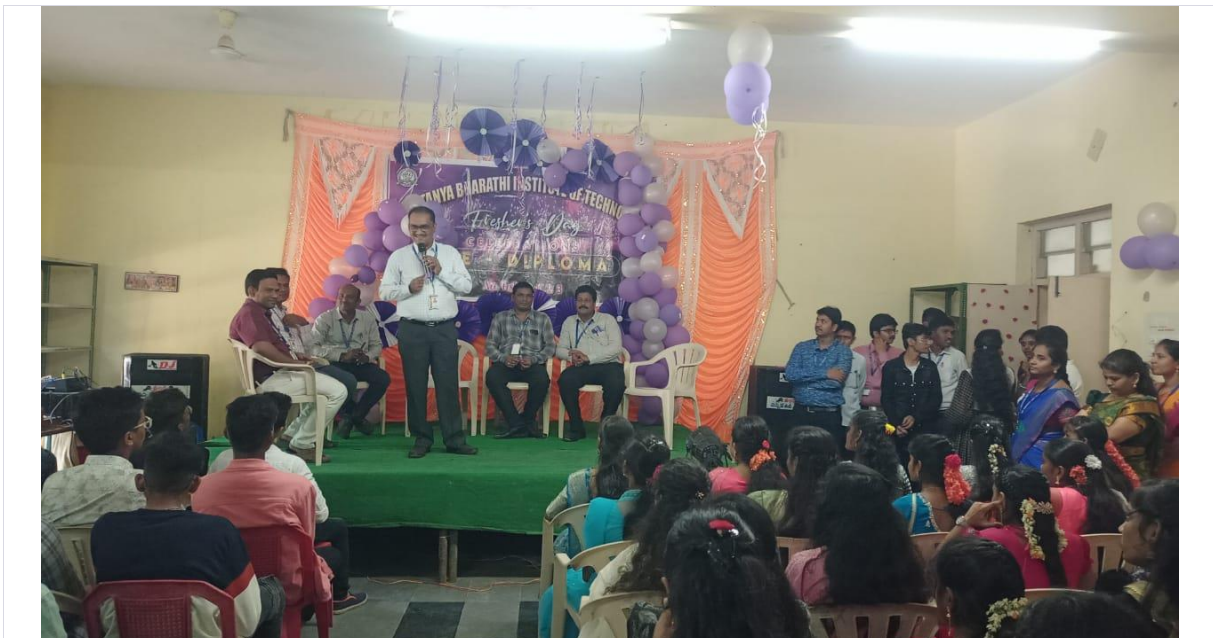
VALUABLE INFORMATION GIVEN BY THE PRINCIPAL SIR TO THE STUDENTS WHO ATTENDED THE EVENT (DCME)