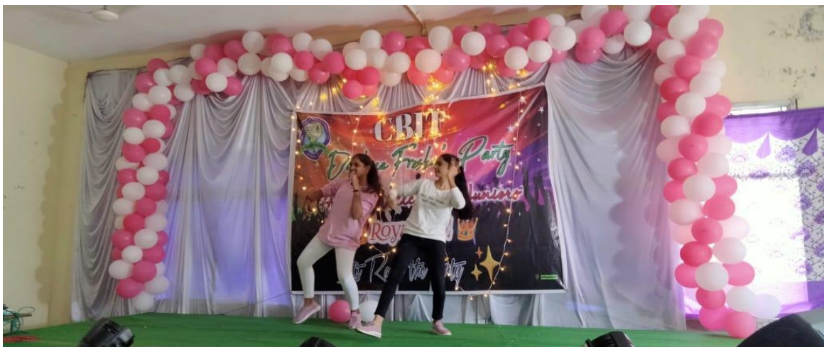
DANCE PERFORMANCE BY THE STUDENTS (DECE)