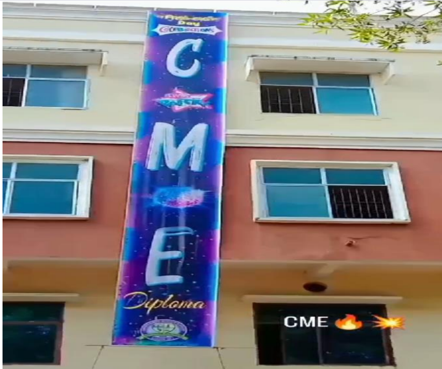
BANNERS FOR THE EVENT (DCME)

(Approved by AICTE New Delhi, Permanently Affiliated to JNTUA, Anantapuram) Accredited by NAAC & Recognized by UGC under the section 2(f) and 12 (b) of UGC Act, 1956 VIDYA NAGAR, PALLAVOLU (V), PRODDATUR-516360, Y.S.R (Dt), A.P