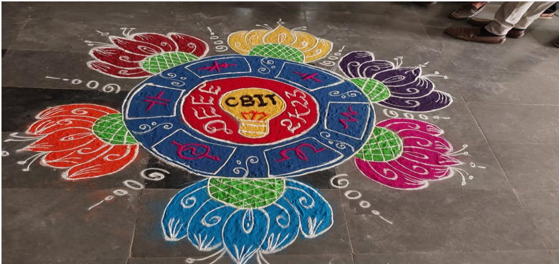
RANGOLI DECORATION FOR THE DEEE BRANCH