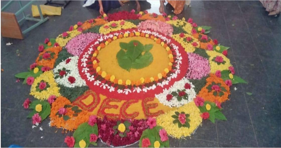
RANGOLI DECORATION FOR THE DECE BRANCH

(Approved by AICTE New Delhi, Permanently Affiliated to JNTUA, Anantapuram) Accredited by NAAC & Recognized by UGC under the section 2(f) and 12 (b) of UGC Act, 1956 VIDYA NAGAR, PALLAVOLU (V), PRODDATUR-516360, Y.S.R (Dt), A.P