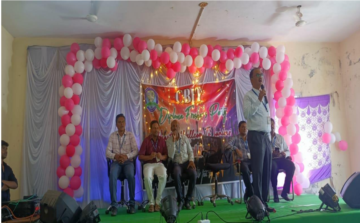
VALUABLE INFORMATION GIVEN BY THE PRINCIPAL SIR TO THE STUDENTS WHO ATTENDED THE EVENT (DECE)

(Approved by AICTE New Delhi, Permanently Affiliated to JNTUA, Anantapuram) Accredited by NAAC & Recognized by UGC under the section 2(f) and 12 (b) of UGC Act, 1956 VIDYA NAGAR, PALLAVOLU (V), PRODDATUR-516360, Y.S.R (Dt), A.P