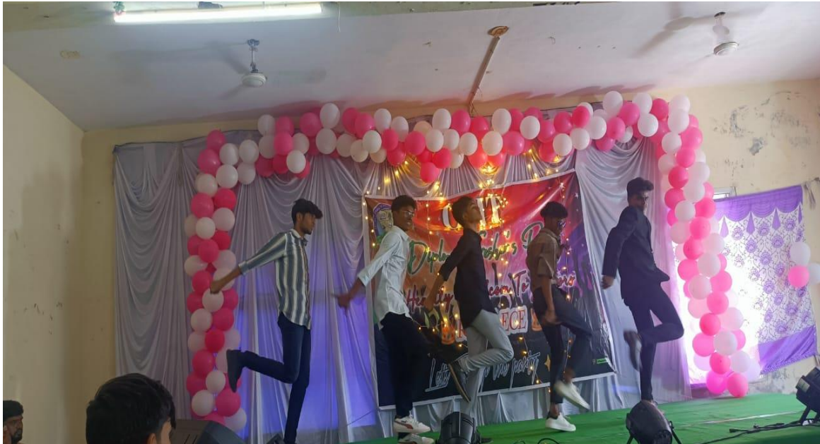
DANCE PERFORMANCE BY THE STUDENTS (DECE)