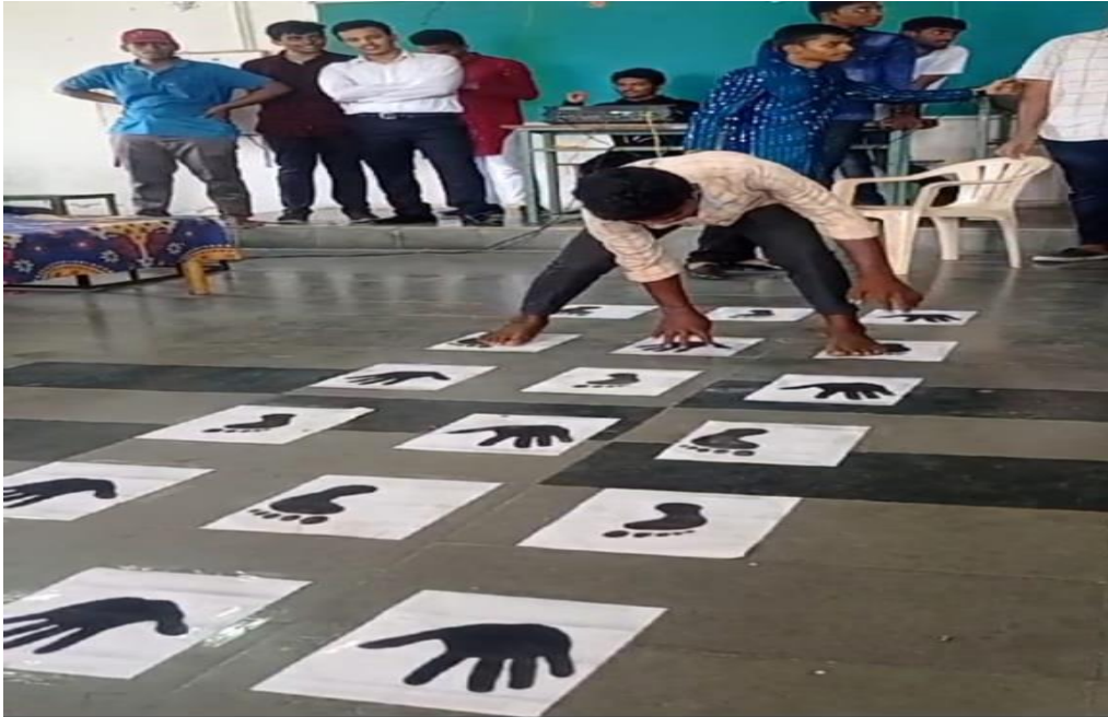
SENIORS CONDUCTED HAND & FEET GAME FOR THE JUNIORS (DEEE)

(Approved by AICTE New Delhi, Permanently Affiliated to JNTUA, Anantapuram) Accredited by NAAC & Recognized by UGC under the section 2(f) and 12 (b) of UGC Act, 1956 VIDYA NAGAR, PALLAVOLU (V), PRODDATUR-516360, Y.S.R (Dt), A.P