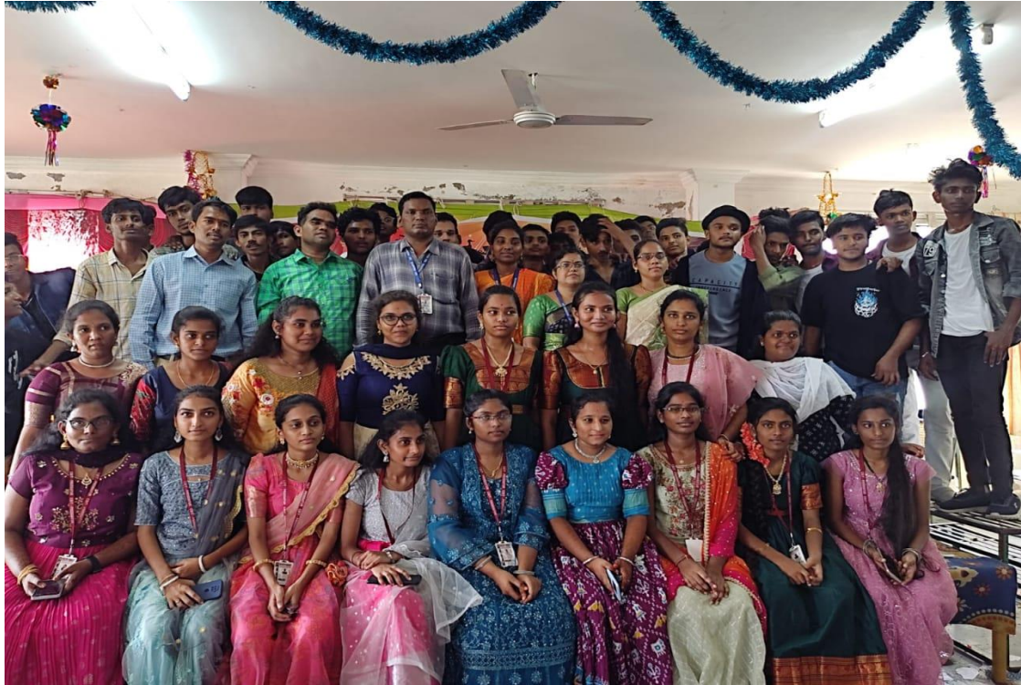
FACULTY GROUP PHOTOS WITH STUDENTS (DEEE)

(Approved by AICTE New Delhi, Permanently Affiliated to JNTUA, Anantapuram) Accredited by NAAC & Recognized by UGC under the section 2(f) and 12 (b) of UGC Act, 1956 VIDYA NAGAR, PALLAVOLU (V), PRODDATUR-516360, Y.S.R (Dt), A.P