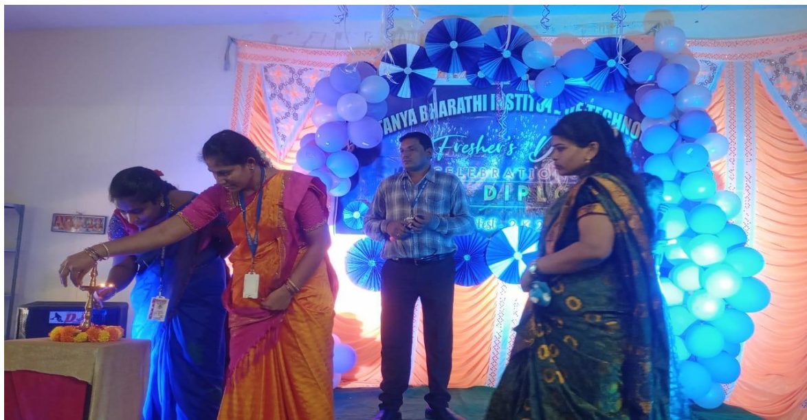
LIGHT LAMPNING IN DCME BRANCH