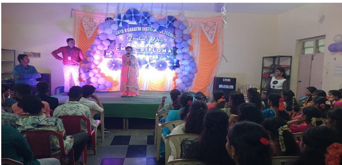
SENIOR SHARING HER EXPERIENCE WITH THE JUNIORS (DCME)