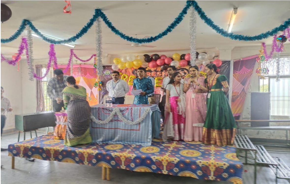
LIGHT LAMPNING IN DEEE BRANCH

(Approved by AICTE New Delhi, Permanently Affiliated to JNTUA, Anantapuram) Accredited by NAAC & Recognized by UGC under the section 2(f) and 12 (b) of UGC Act, 1956 VIDYA NAGAR, PALLAVOLU (V), PRODDATUR-516360, Y.S.R (Dt), A.P