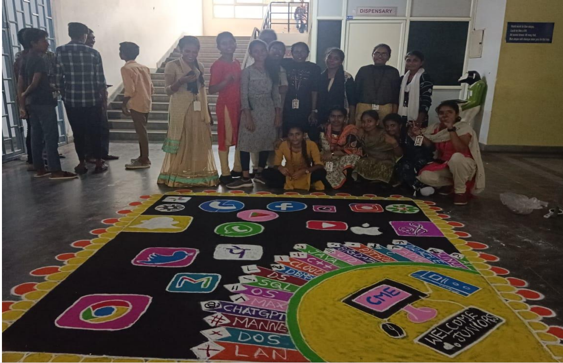
RANGOLI DECORATION FOR THE DCME BRANCH