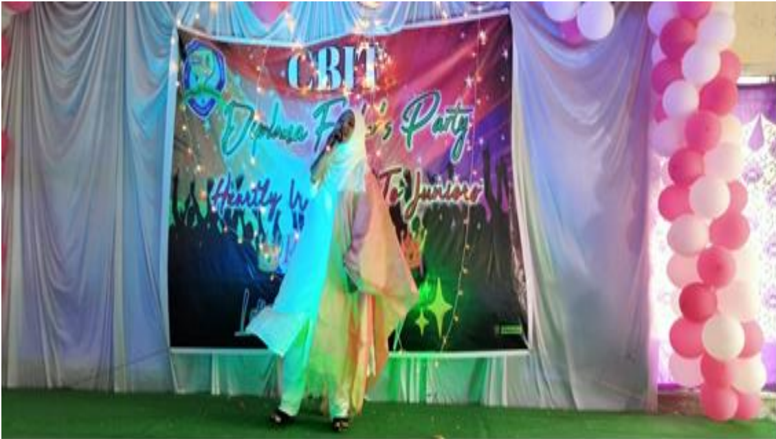
SENIOR SHARING HER EXPERIENCE WITH THE JUNIORS (DECE)

(Approved by AICTE New Delhi, Permanently Affiliated to JNTUA, Anantapuram) Accredited by NAAC & Recognized by UGC under the section 2(f) and 12 (b) of UGC Act, 1956 VIDYA NAGAR, PALLAVOLU (V), PRODDATUR-516360, Y.S.R (Dt), A.P