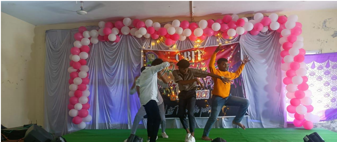
DANCE PERFORMANCE BY THE STUDENTS (DECE)