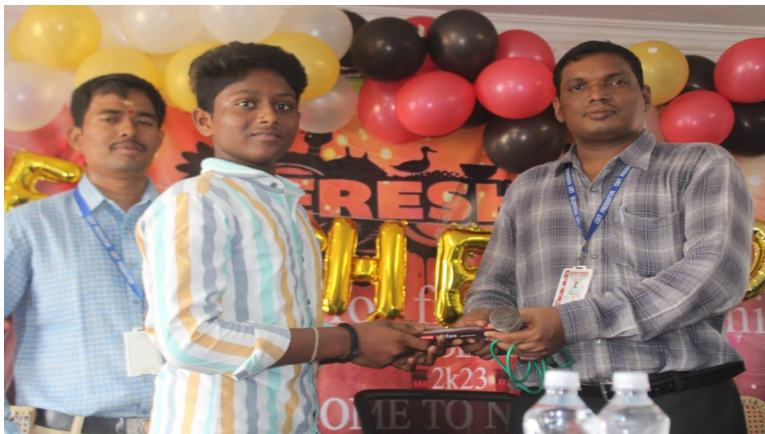
MEMORABLE GIFT FOR THE WINNERS IN THE EVENT (DEEE)