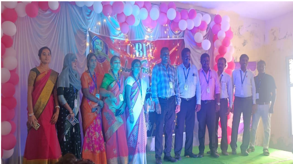
FACULTY GROUP PHOTOS (DECE)